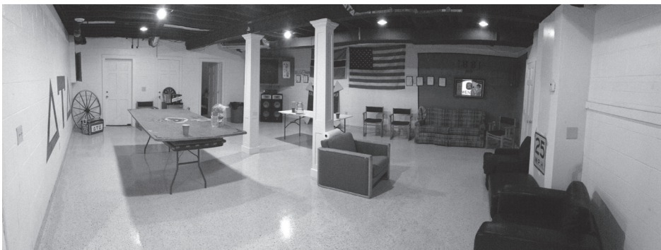
The newly renovated basement at the Chi Delt Lodge.